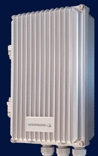
4. Power Receiver Unit Outdoor

HEXATRONIC Cables & Interconnect Systems