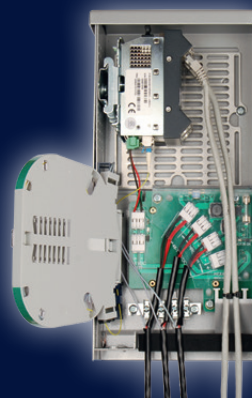
4. Power Receiver Unit Indoor