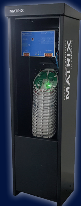
The InOne Power Rectifier, Power tray and Fiber Trays integrated into Hexatronic MATRIX Compact Fiber Access Terminal

Owning your own power gives another dimension to the term security and reliability for critical applications. No need to worry about local power interruptions, UPS battery maintenance etc.