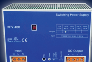
1. Access Node Rectifier