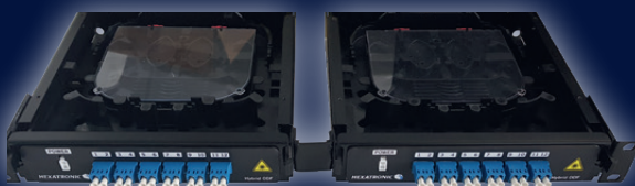
2. Hybrid Termination Panels Rack mount