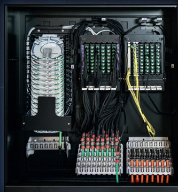
Compact Fiber Distribution Hub