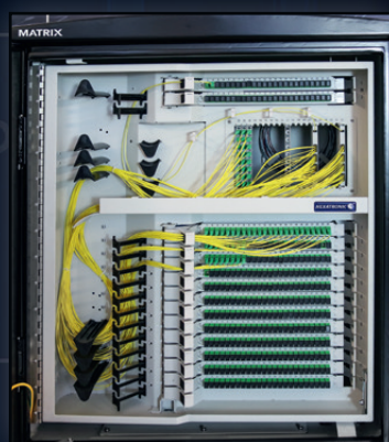
High Capacity Fiber Distribution Hub