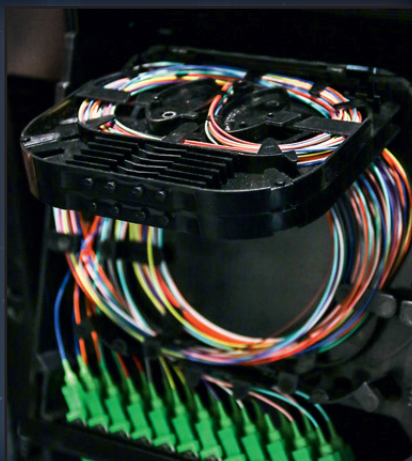
Well-organized Fiber Handling