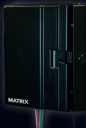
Fiber Access Terminal

Other network materials in the Drop & Premises MATRIX include a low-cost aerial drop system, miniature termination boxes and FTTH demarcation points.