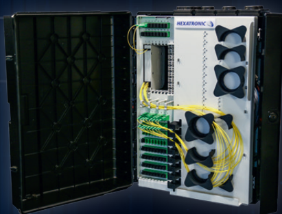
Fiber Distribution Hub for Indoor Use