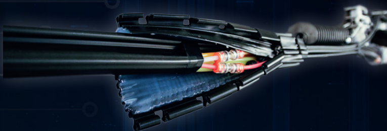
Products for Aerial Air-Blown Fiber Installation

Hexatronic ABF Installation Tool with the New Air Blown Fiber Stingray