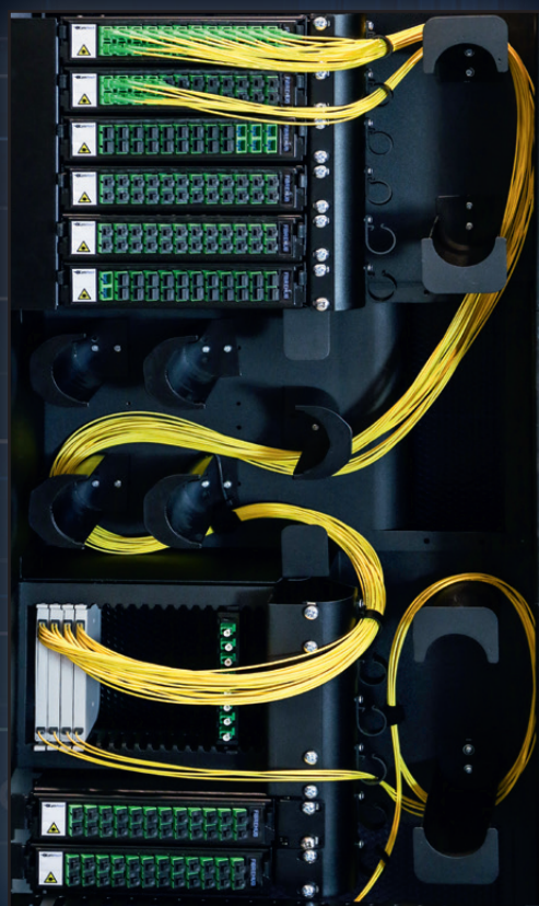
High Capacity Fiber Management System